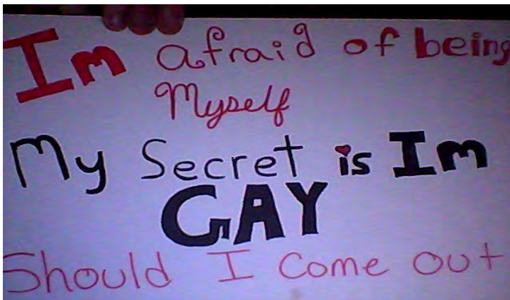
Figure 3. Student note (Coming out).

An illustrative example of when Kellie had to take action to maintain a safe space includes an instance in which a student shared that she was gay and asked the TWIMC Facebook community if she should come out (see figure 3 below).